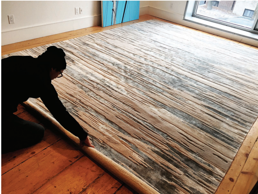
The Ice Storm Rug Hand-knotted in Wool & Bamboo 80 knots per inch, 10'x13' Private King City Client