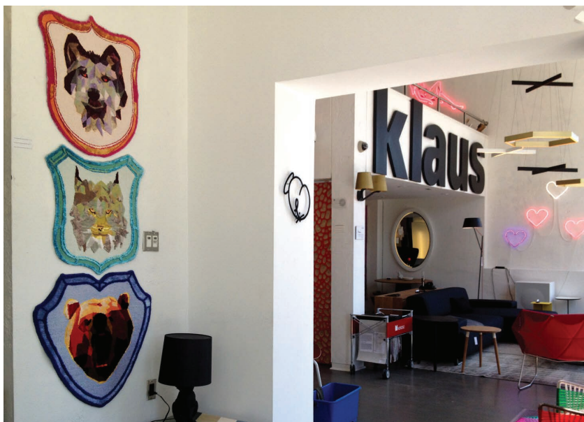
Totem Animal Crests Hand-knotted in Wool & Silk 100 knots per inch, 2'x2' Won DesignLines Award at IDS 2014