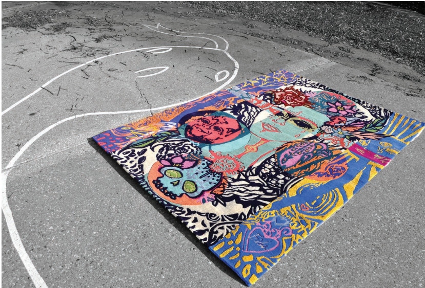
Frida Kahlo Rug Hand-knotted in Wool & Silk 100 knots per inch, 5'x7'