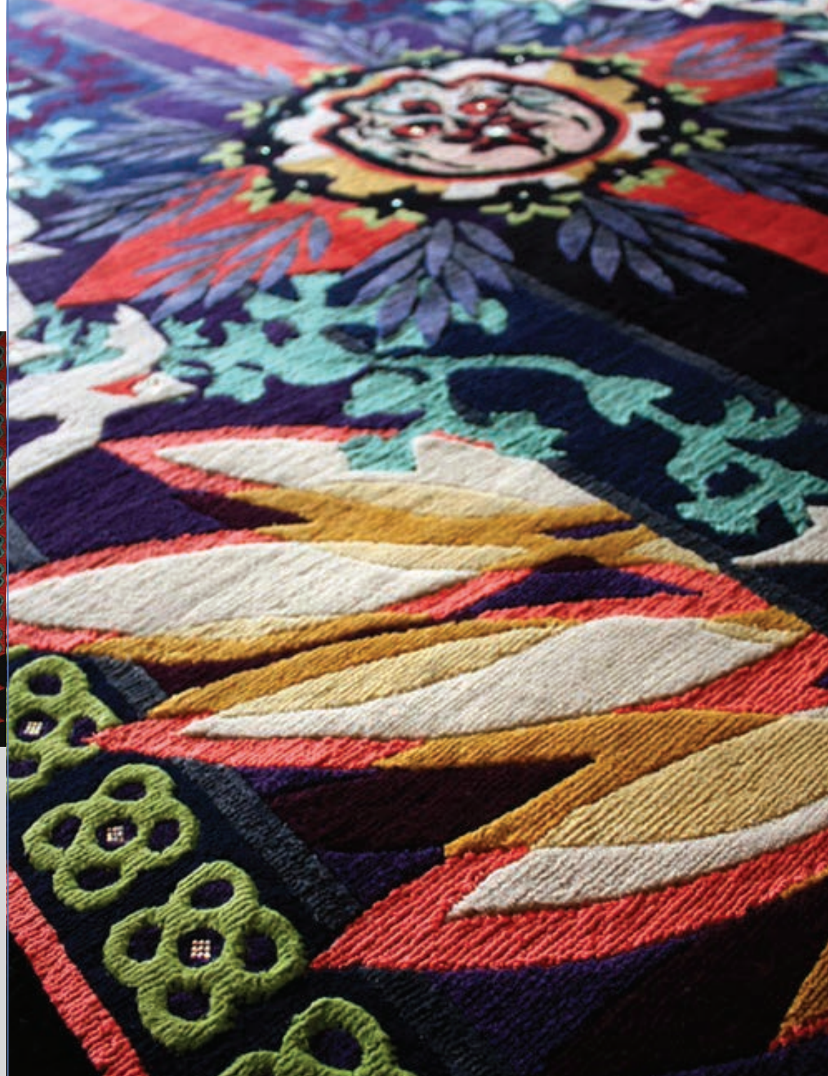
The Prayer Rug Collection Six Limited Editions 1/1 Hand-knotted in Wool & Silk 100 knots per inch, 4'x6' Created for Modallion By Reznick Carpets