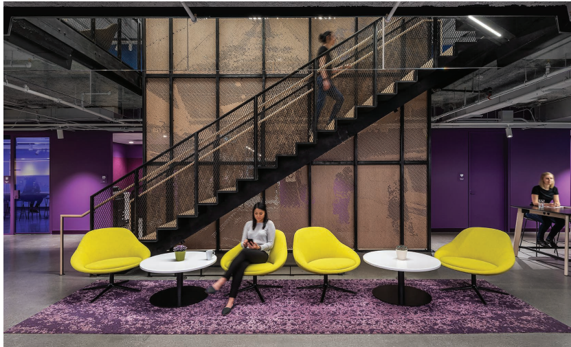
A Collection of 12 Custom Jan Kath Rugs Hand-tufted in Wool & Nettle Design Firm: In Studio Design Corporate Office