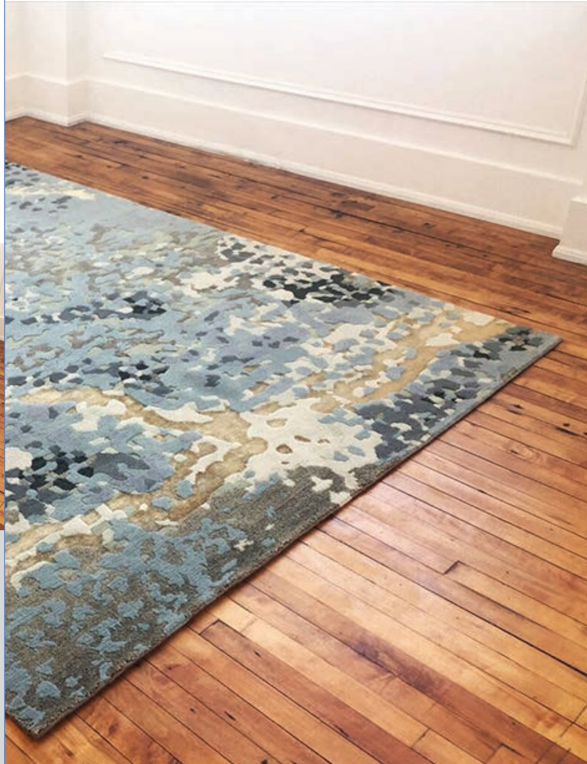
Daphne Hand-knotted in Wool, Hemp & Bamboo 80 knots per inch, 6'x8' Commissioned by Attic Gold