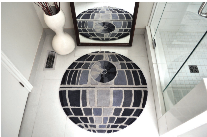
(Top) Small Death Star Rug Hand-tufted in Wool, 3'x3'