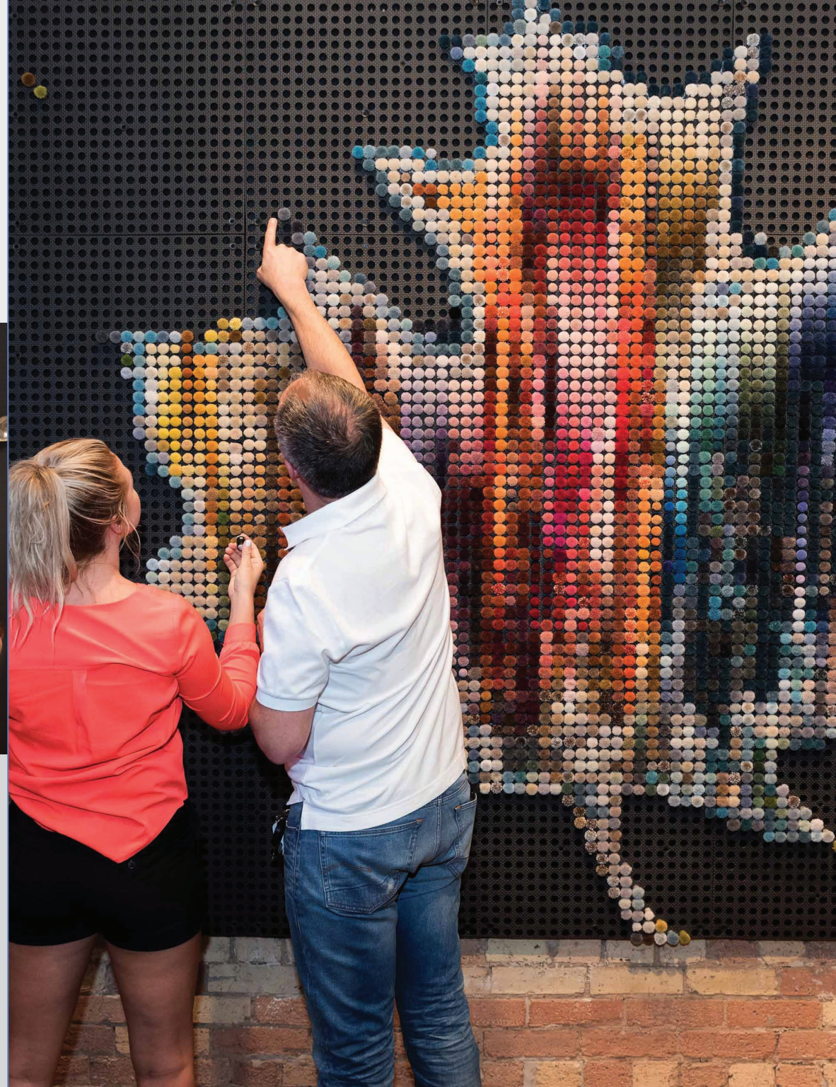
Two Interactive Pom Mosaic™ Installations Wool Carpet Poms, Foam & Wood Panels Each has 6000-8000 Carpet Poms, 8'x10' Canada 150 Event at The Carpet Factory Commissioned by Heritage Properties