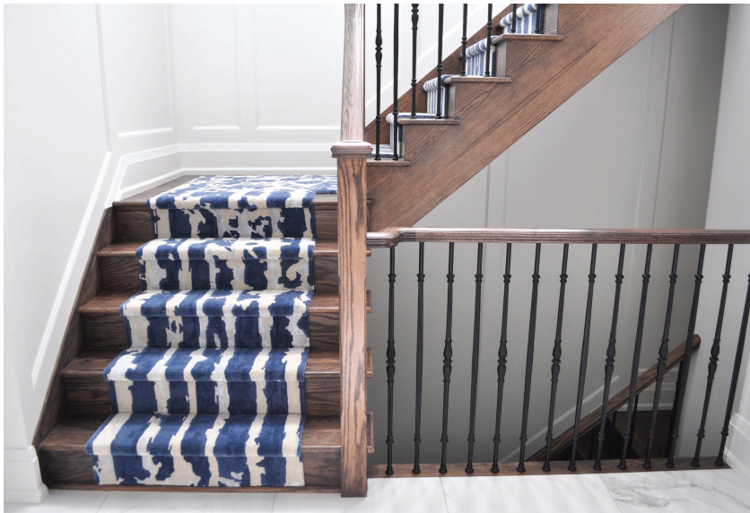
Custom Stair Runner Hand-knotted in Wool & Bamboo 80 knots per inch Private King City Client