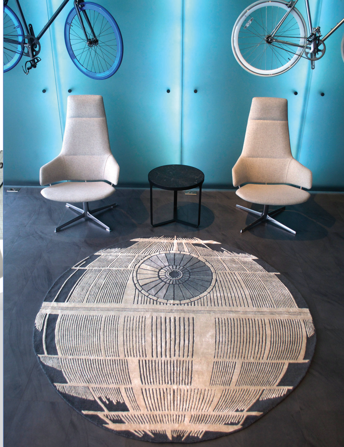
(Left) The Death Star Rug Hand-knotted in Wool & Silk 100 knots per inch, 8'x8'