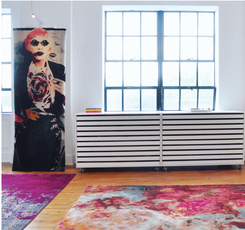
The Gaga Rug Hand-knotted in Wool & Silk 100 knots per inch, 3'x8' Created for Modallion By Reznick Carpets Won DesignLines Award at IDS 2013