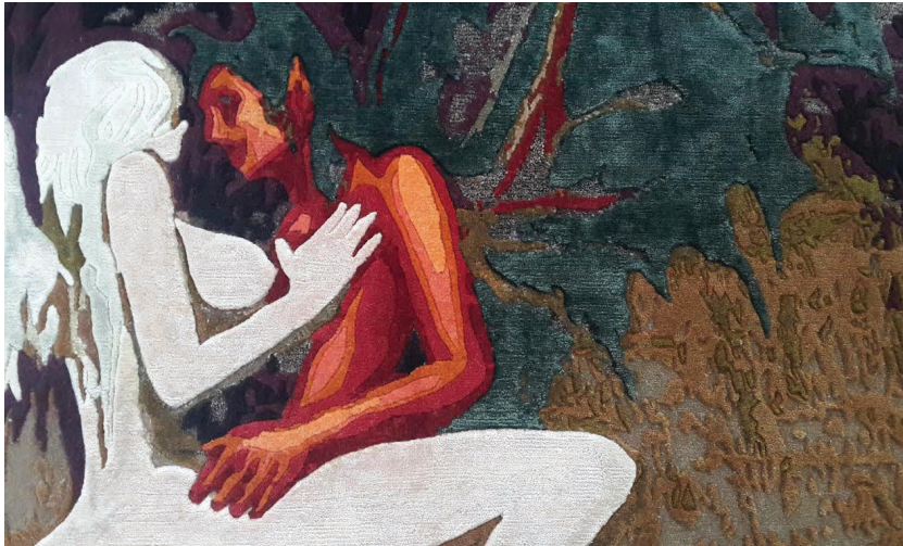
Apocalyptic Love Rug Hand-knotted in Wool, Silk & Hemp 100 knots per inch, 5'x7' For SLASH from Guns & Roses